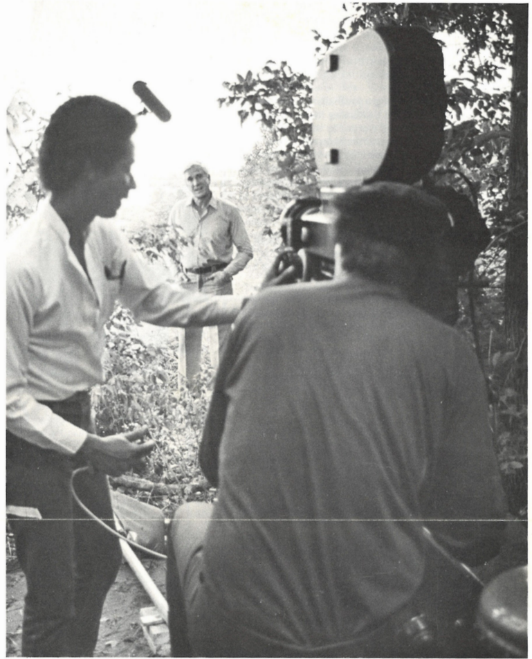
Leslie Nielsen, veteran Hollywood actor and Shell's new TV spokesman, reads lines from a commercial filmed at Wood River while cameramen set up the shot.

As for Nielsen, he feels "terrific" about being the Shell spokesman. "I really enjoy this form of communication."