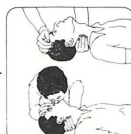
TRY TO VENTILATE