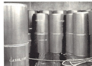
SUPER SHELL, in carefully measured amounts, awaits use by the contestants.