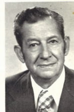
Leon Little Engineering Field