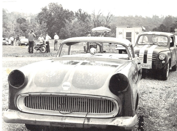
The Visser entry (foreground), a 1959 Opel, shattered the previous records in both miles-per-gallon and ton-miles-per-gallon, while the Carlson-Trokey entry, a 1959 Fiat, captured second place honors in miles-per-gallon.