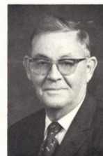
Marlin Packard Engineering Field