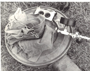
A familiar scene in the starting pits . . . parts, tools, rags and instruments. Last minute super-tuning was the order of the day.