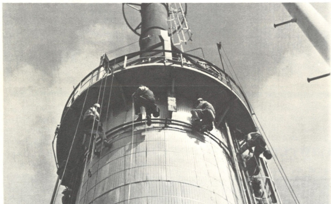
The Distillate Hydrotreater unit recently received a facelift in the form of a shutdown. These workers are putting the final touches on new insulation.