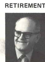
George Eardley Engineering Field