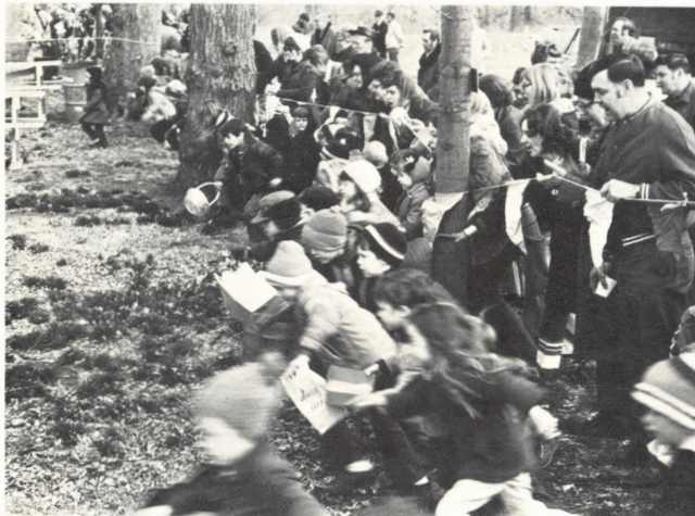
They're off! The kids get the word to go at the annual Easter Egg Hunt, held on a rather wintry March 25. Despite chilly winds and an overcast sky, there was a good turnout, and action for the prizes was brisk.