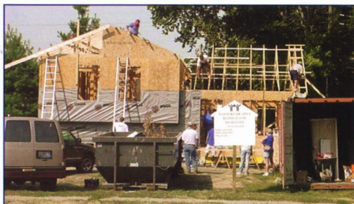
Wood River Refinery employees raise the roof!