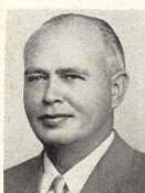
J. M. Linder Distilling