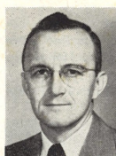
J. R. Watson Control Lab.