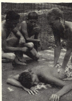
Many lives have been saved by Boy Scouts who have been trained in artificial respiration, as here demonstrated at Camp Warren Levis pool. The Boy Scout program is dependent on your Community Chest contribution.

While only six per cent of the world's population lives in the United States, 75 per cent of all the automobiles in the world are in this country.